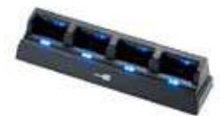
4-Slot Battery Charger

©2010 CipherLab Co., Ltd. All specifications are subject to change without notice. All rights reserved. All brand, product and service, and trademark names are the property of their registered owners.