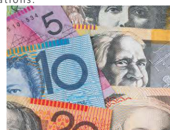
Multiple detection ways