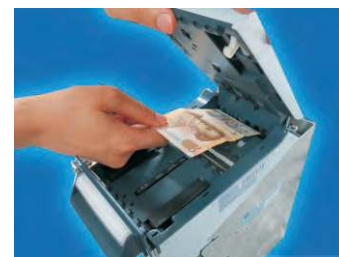
Easy solution of bill jams