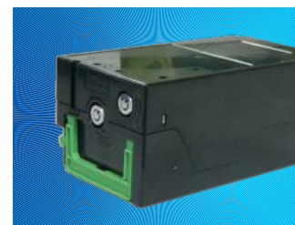
Design with high security