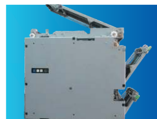
Easy bill jam solution