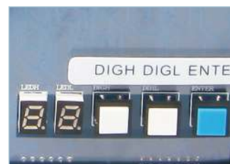
Offline trouble shooting