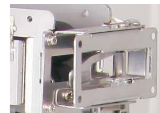
High acceptance speed