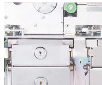
Design with high reliability