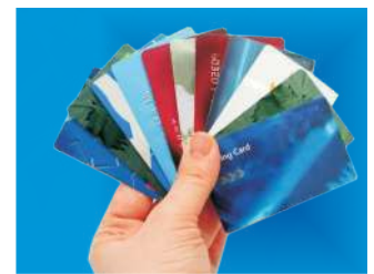
Available to various tickets