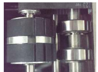
Design with high reliability