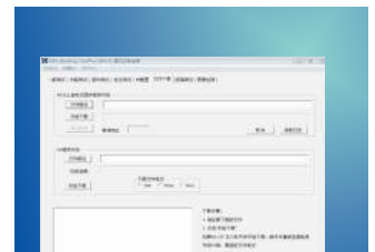
Online software upgrading

Note : In case the specifications be upgraded, you may as well contact with us to get the latest information. The picture shall be taken as a reference. The product appearance depends on goods.